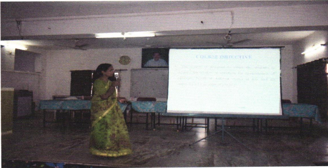
Fig No:3. Students attending orientation on Ant ragging committee