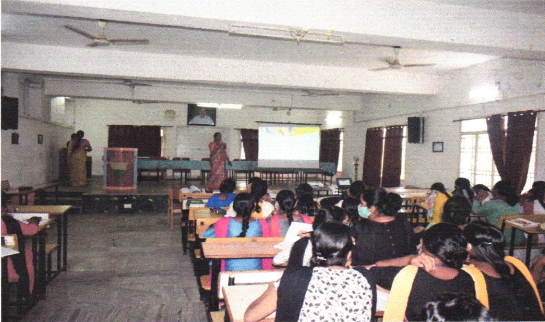
Fig No 2: Students are attending the Orientation session